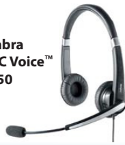
Jabra UC Voice™ 550