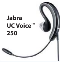
Jabra UC Voice™ 250