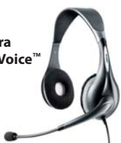
Jabra UC Voice™ 150